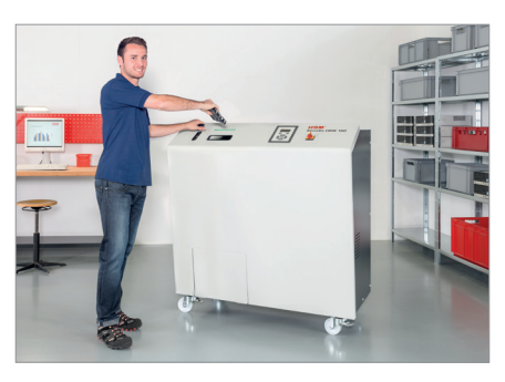
For decentralised destruction

The large and clearly visible LED display enables the continuous input of media at a comfortable working height.