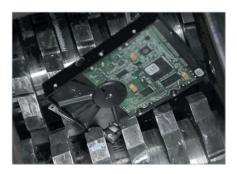
Material anti-jam function

Data media can be shredded easily in decentralised locations with this machine.