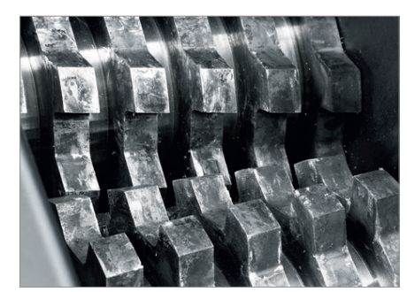
Solid steel cutting rollers

The selection of the correct functional mode will always ensure maximum throughput for the respective material type.