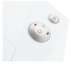
The full bin is indicated via the display and the machine switches off automatically.

The induction-hardened, solid steel cutting rollers guarantee durability.