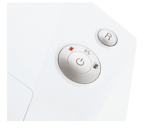
The full bin is indicated via the display and the machine switches off automatically.

The induction-hardened, solid steel cutting rollers guarantee durability.