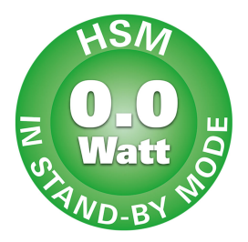
In stand-by mode, the document shredder does not consume any power.