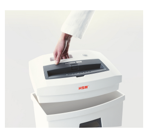
To empty the waste container, the housing top can be easily removed – a practical, recessed grip facilitates handling.