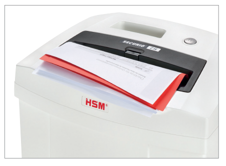
Anti-paper jam function

The document shredder has been awarded the Blue Angel certificate for its durable construction, low energy consumption and the use of environmentally friendly materials.