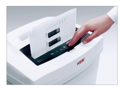
High level of user safety

The paper feed with overload protection reduces paper jams and sustains the high throughput of paper.