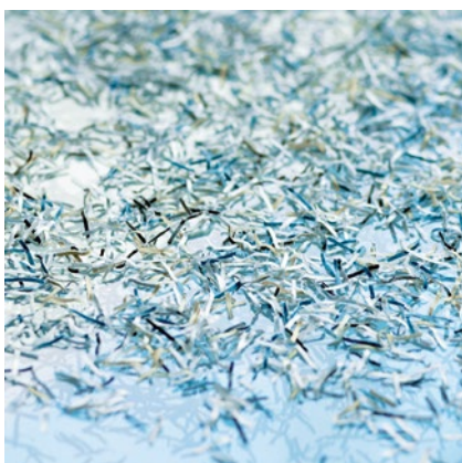
P-6 security: recommended for data media containing secret data demanding exceptionally stringent security measures