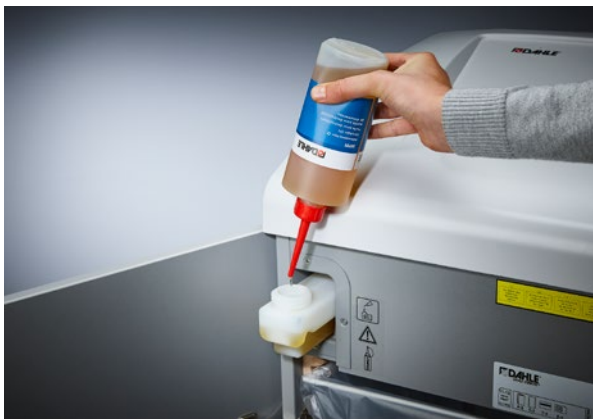
Dahle Top Secret 606 document shredder