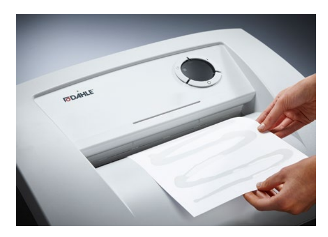
Dahle Waste 206 document shredder