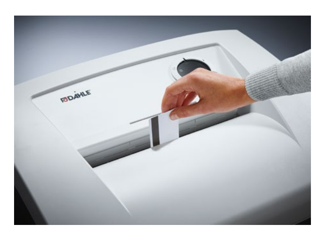
Dahle Waste 206 document shredder