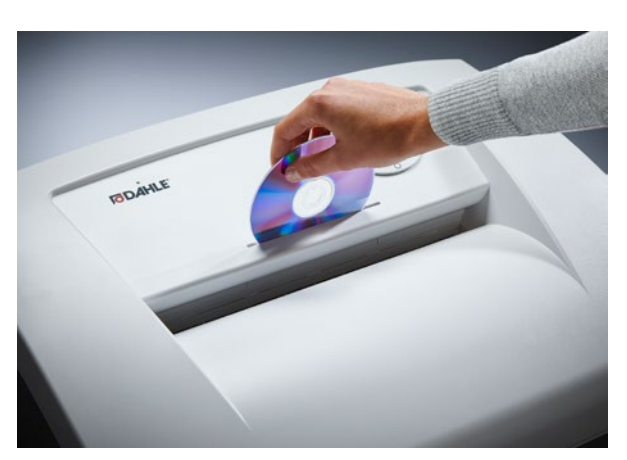
Dahle Waste 206 document shredder