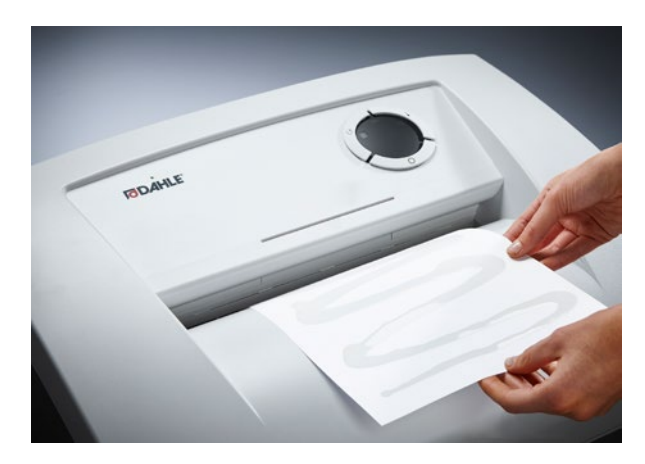
Dahle Waste 210 document shredder