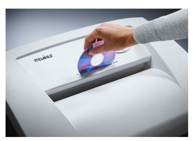
Dahle Waste 210 document shredder