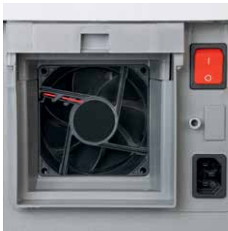
Powerful fan sucks in fine dust particles inside the document shredder and feeds them to the filter