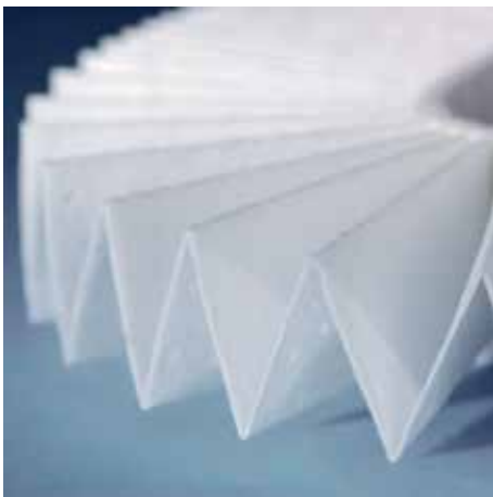
Environmentally friendly filter is made of special 3-ply, fully recyclable non-woven material