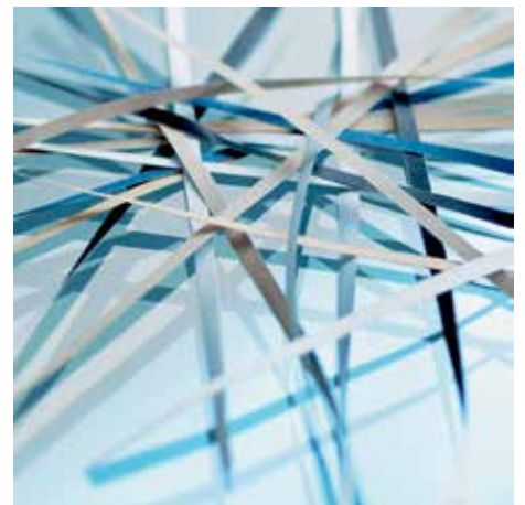
P-2 security: recommended, for example, for data media containing internal data that are to be made illegible