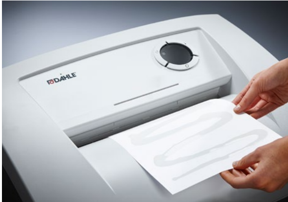
Dahle Waste 206air document shredder