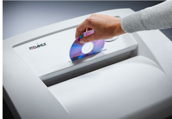
Dahle Waste 206air document shredder