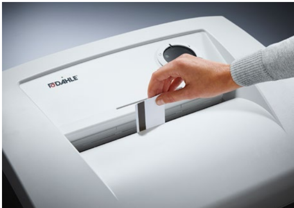
Dahle Waste 206air document shredder