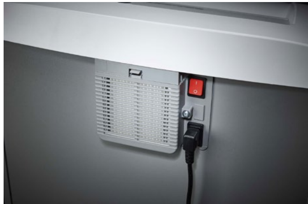
Dahle Waste 206air document shredder