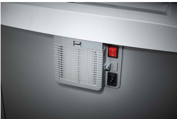
Dahle Waste 206air document shredder