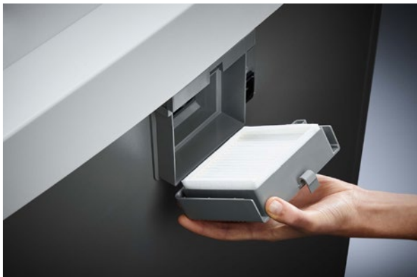
Dahle Waste 206air document shredder