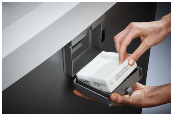
Dahle Waste 206air document shredder