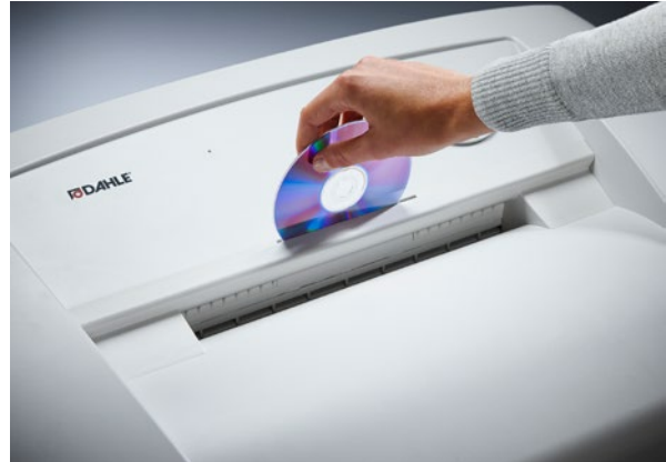
Dahle Waste 214air document shredder