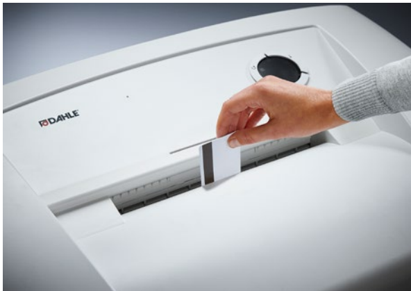
Dahle Waste 214air document shredder