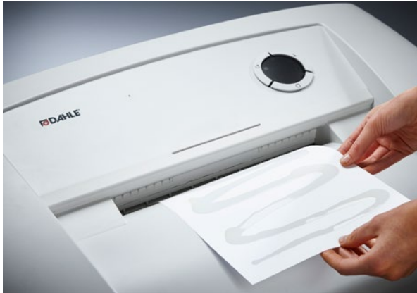
Dahle Waste 214air document shredder